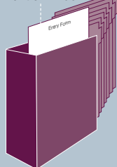
Front of Binder

Make sure the following are included in your binder: