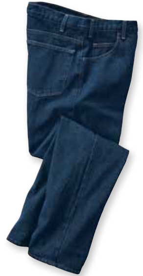
Vestis™ Denim Classic 5-Pocket Jeans GP-0294