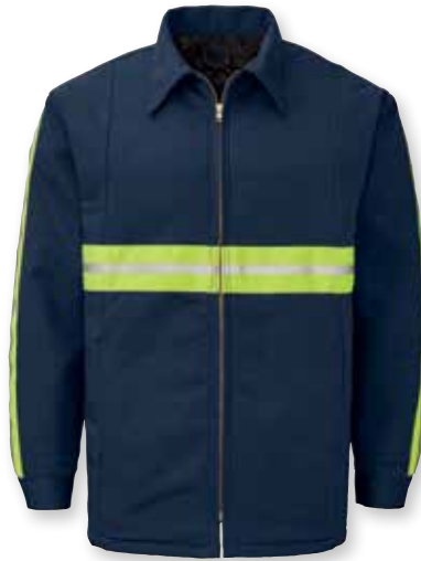
Aramark Enhanced Visibility Jacket GO-2982