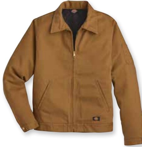
Dickies Canvas Jacket GO-2593