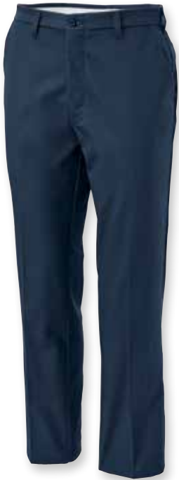
Vestis™ Men's Flat-Front Work Pants GP-0002