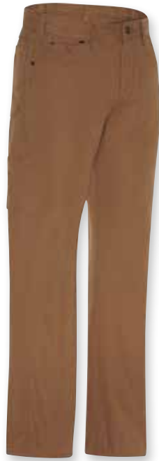
Dickies® Carpenter Duck Jeans GP-1062