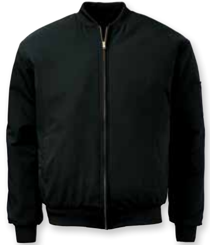
Aramark Industrial Team Jacket GO-0575