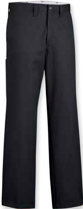
Dickies® Cell-Phone Pocket Work Pants GP-0564