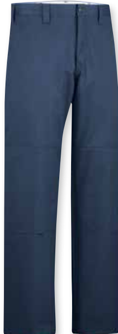
Dickies® Double-Knee Industrial Work Pants GP-0936