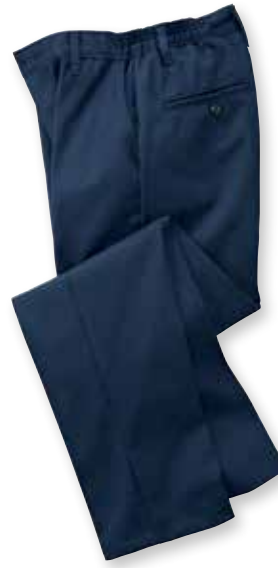
Vestis™ Women's Side-Elastic Waist Work Pants GP-0207