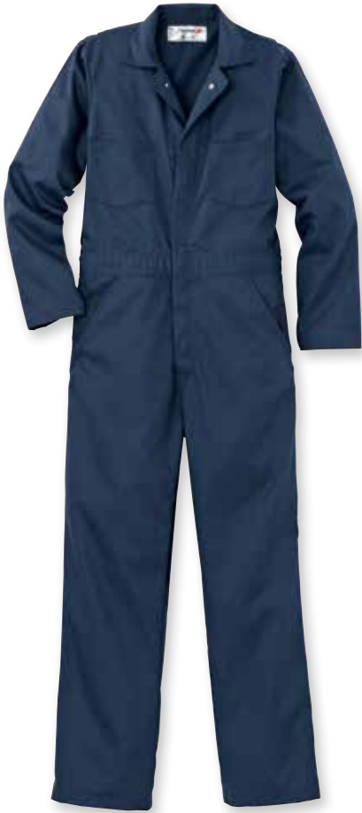
Aramark Heavy-Duty Twill Coveralls GO-0011